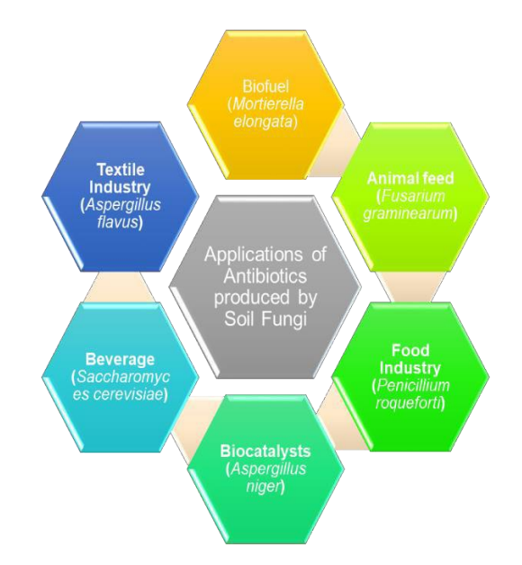
Figure 2: Applications of Antibiotics Produced by Soil Fungi

conditions play an important role in antibiotics production by fungi, so the determination of optimized physiochemical conditions is also needed.